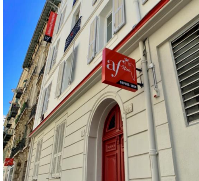
Air conditioning & double glazing