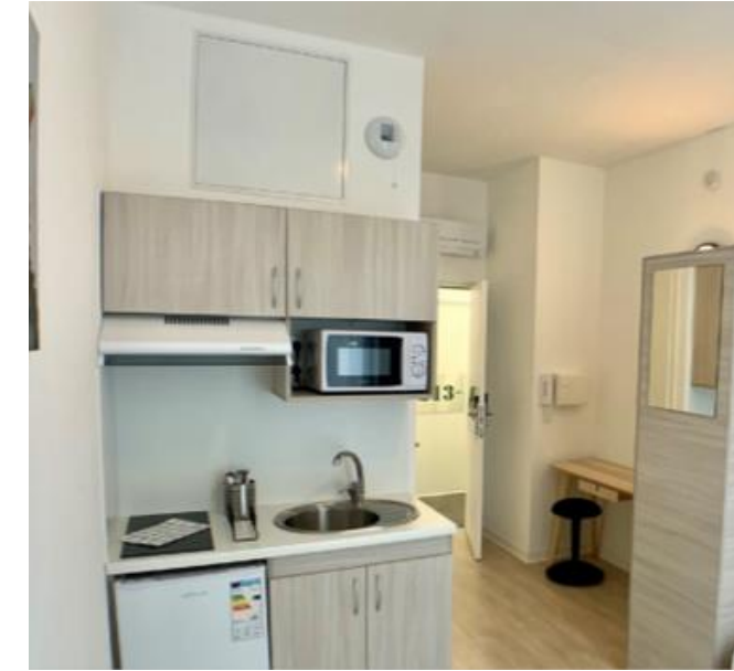
Guardians & video surveillance