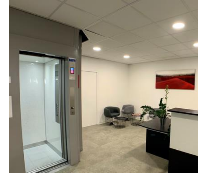
Lavry & concierge service