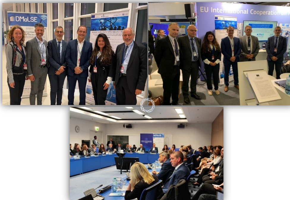
Photo from the event