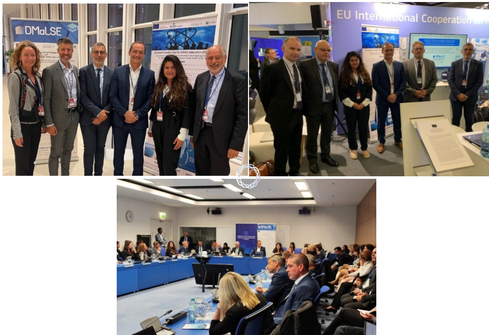
Photo from the event